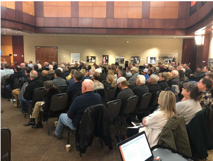
Appraiser Attendees