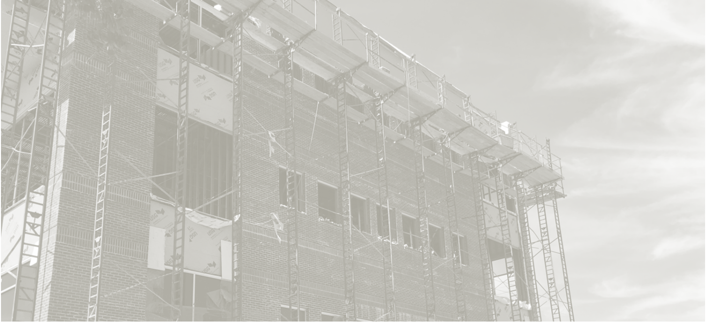
400 NE 50 th Street, Oklahoma City