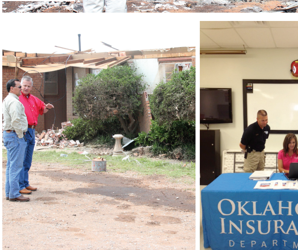
Top: Commissioner Doak surveys wildfire damage in Mannford on August 5, 2012.