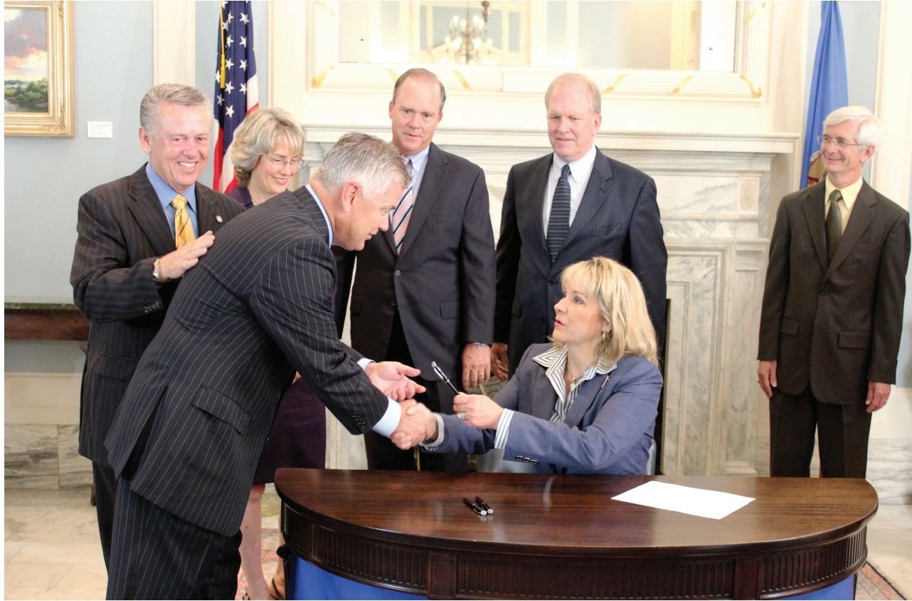
Top: Commissioner Doak shakes hands with Governor Mary Fallin during a bill-signing ceremony at the State Capitol.