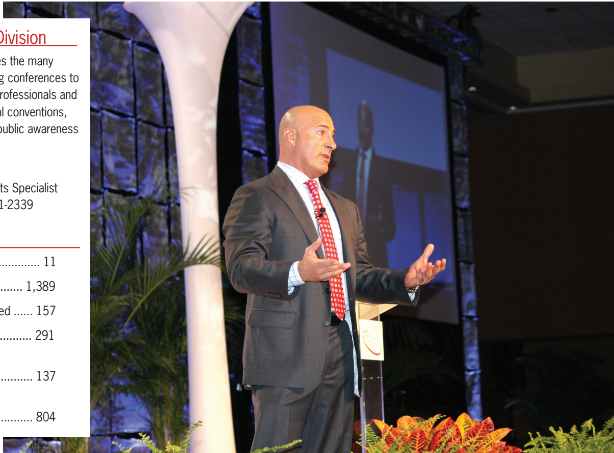
Top: The Weather Channel's Jim Cantore speaks to the crowd at the National Tornado Summit in Oklahoma City in March 2012.