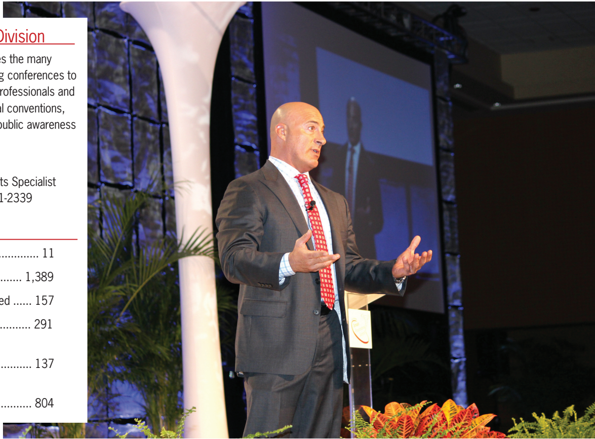
Top: The Weather Channel's Jim Cantore speaks to the crowd at the National Tornado Summit in Oklahoma City in March 2012.